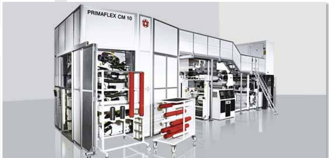
Windmoller and Holscher Printing press

Going forward I believe that we as a company need to look back at our roots to see that Convex was built on innovation and design. If we continue to dedicate time and resources on development then we can attain the kind of results that the German suppliers have achieved.