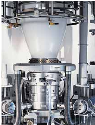
Alpine Series X Die head

As Convex's mechanical engineer I was lucky enough to be the recipient of the 2007 Overseas Training Award from the New Zealand Craftsman Training Foundation. I returned to New Zealand last year in October having spent four weeks in Malaysia and Germany where I attended Drupa, the world's largest printing trade fair.